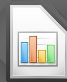
Chart is a business graphics module, integrated with Calc and Impress, which lets you create histograms, pie charts and other visual representations of data.

Base is a desktop database designed to meet the needs of most users, which can also be used as a front end to most enterprise-class databases.